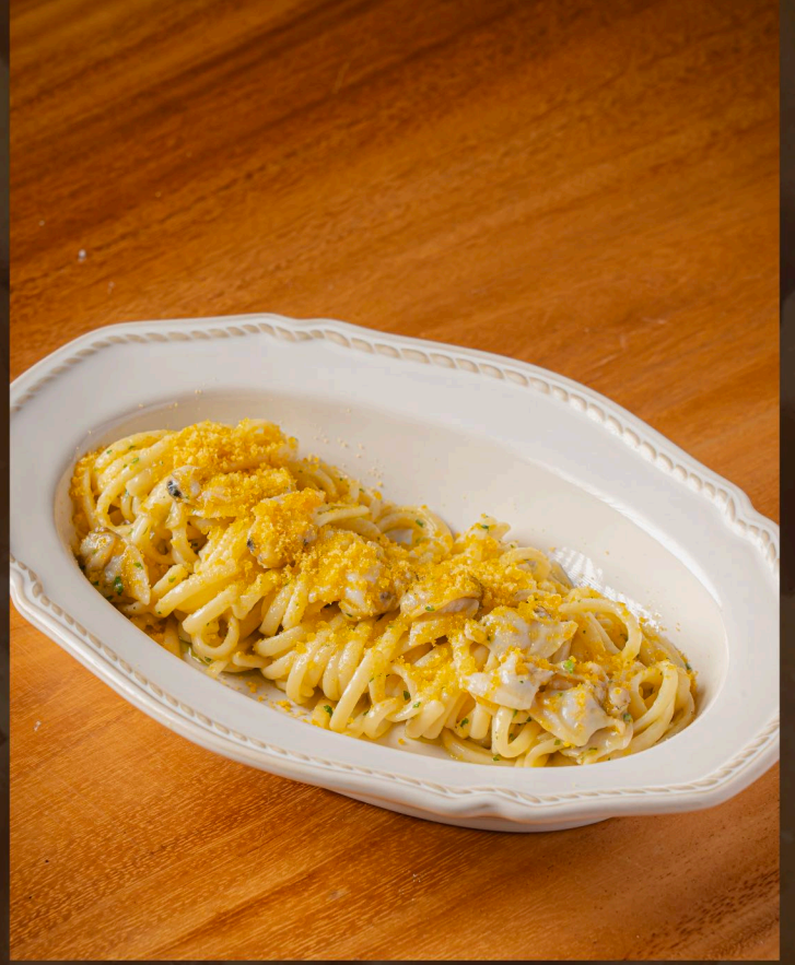
VONGOLE ★ 590 White Wine Clam Sauce - Chili Oil - Bottarga