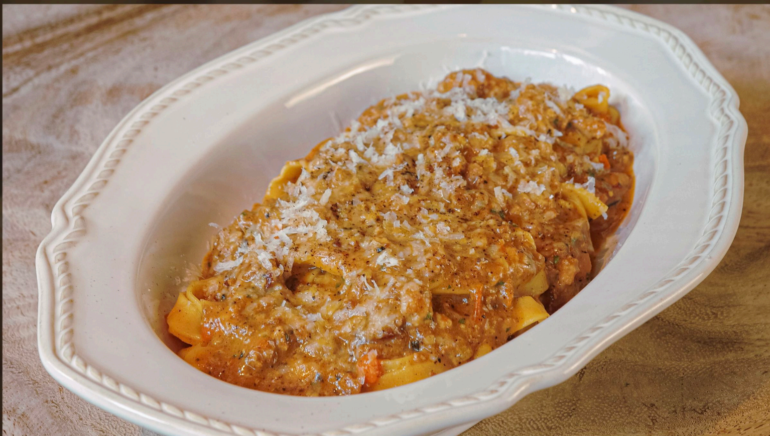
TAGLIATELLE ALLA BOLOGNESE