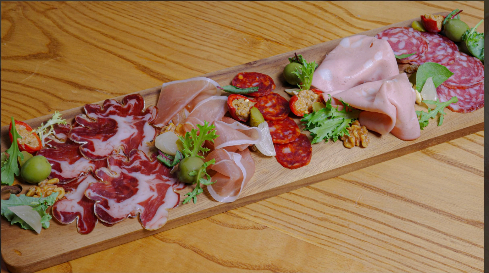
COLD CUT BOARD L