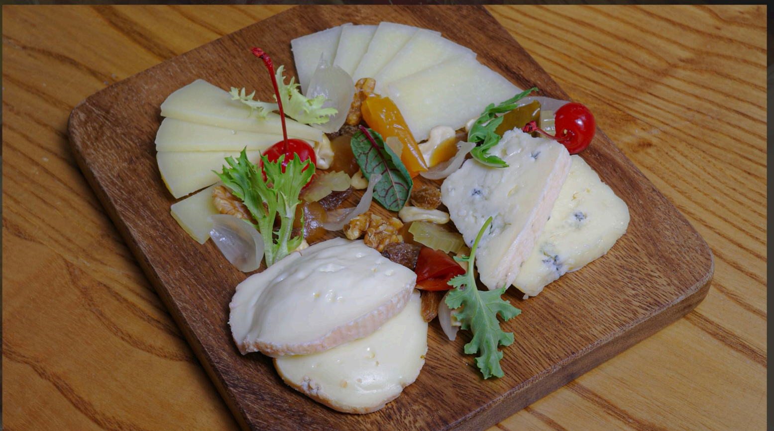
CHEESE BOARD L