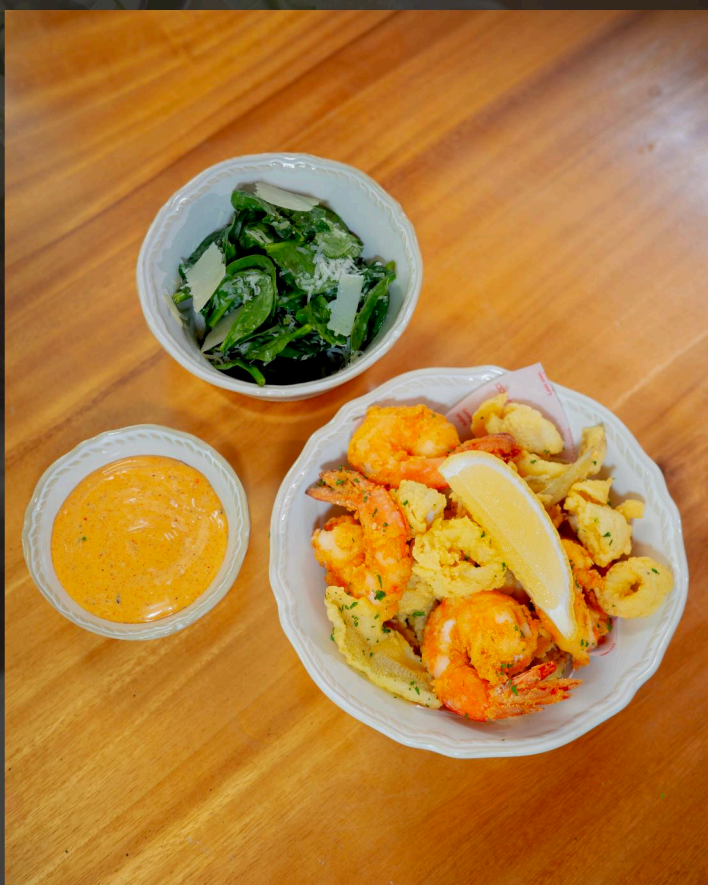
FRITTO MISTO MIXED SEAFOOD 440 Smoked Aioli - Baby Spinach Salad