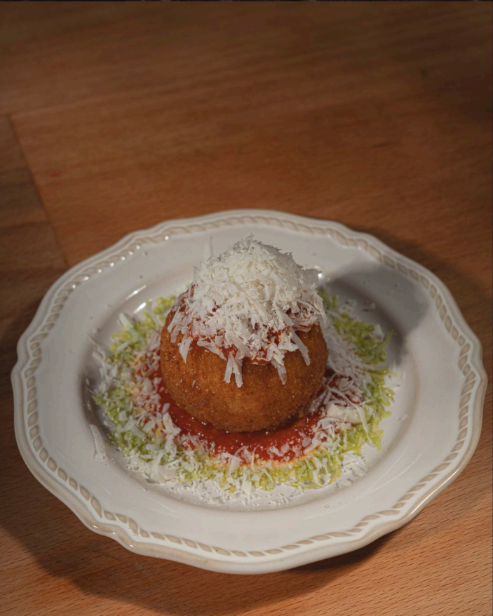
CAPRICCI ARANCINI 240/pcs Sicilian Ragù - Smoked Ricotta