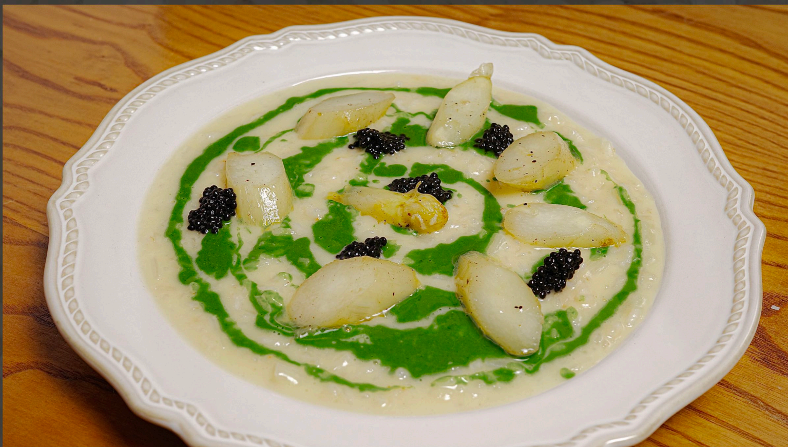
RISOTTO WHITE ASPARAGUS ★ Herring Roe - Wild Garlic