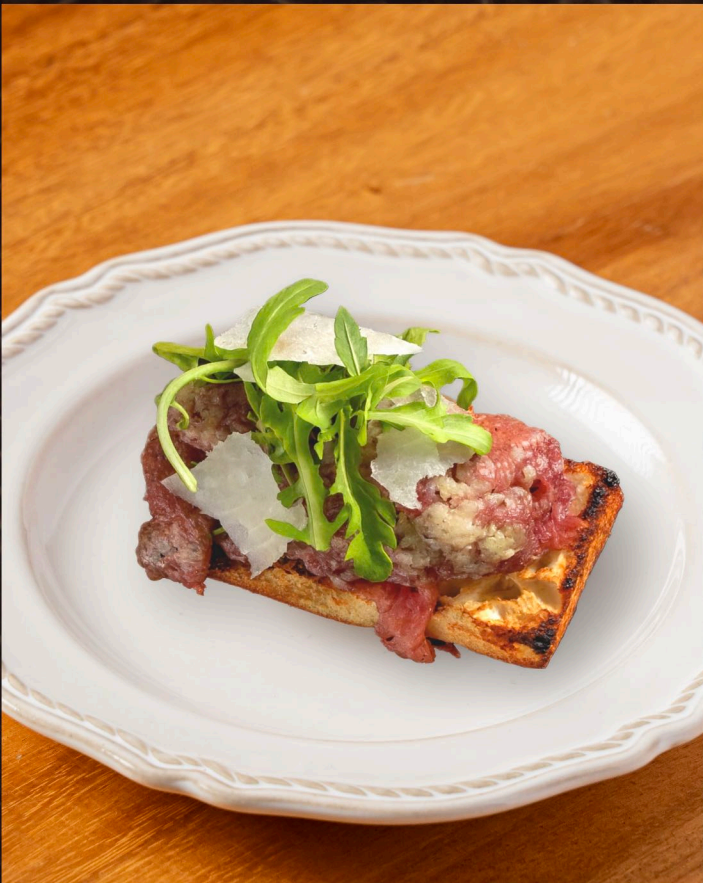
WAGYU BEEF 180/pcs CARPACCIO Crispy Bread - Wild Rocket - Parmesan