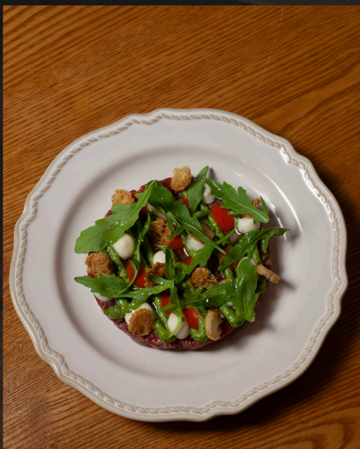
BEEF TARTARE 690 Rocket - Pesto - Parmesan