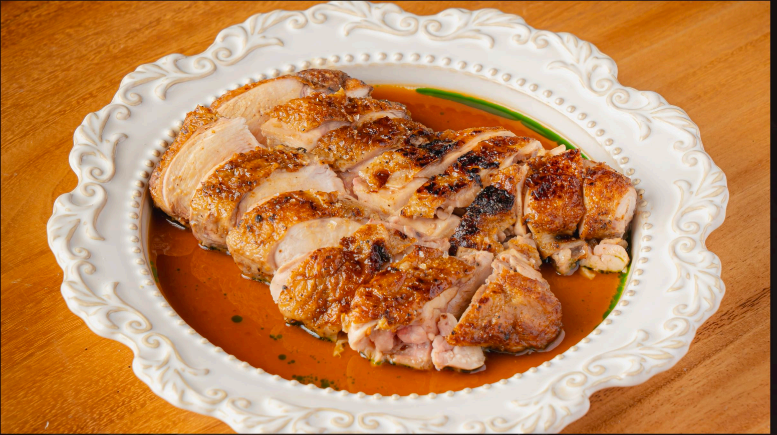
FULL BABY CHICKEN Rosemary