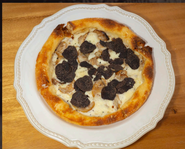
PORCINI MUSHROOMS 480 Fior Di Latte - Mascarpone - Black Truffle