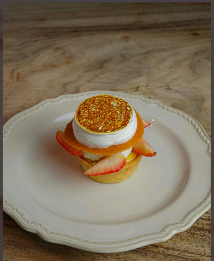
CHEESE TART 390 Strawberry - White Chocolate - Vanilla