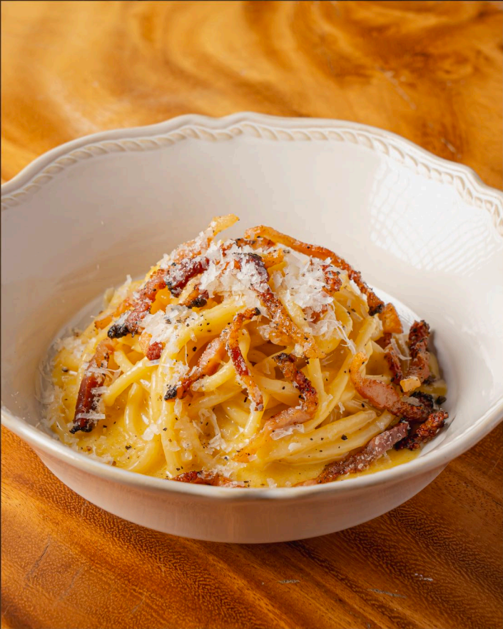
SPAGHETTI 480 CARBONARA Pecorino - Guanciale