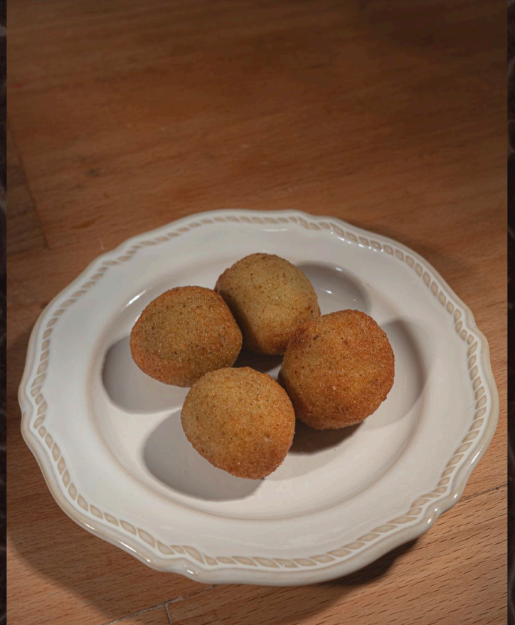
OLIVE ASCOLANE 240/4pcs Deep-Fried Stuffed Olives