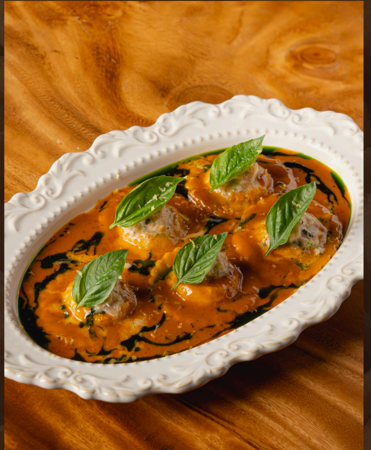
CRAB RAVIOLI 680 Basil - Lime - Chili