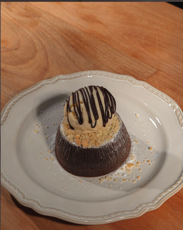
WARM CHOCOLATE FONDANT 390 Vanilla Ice-cream