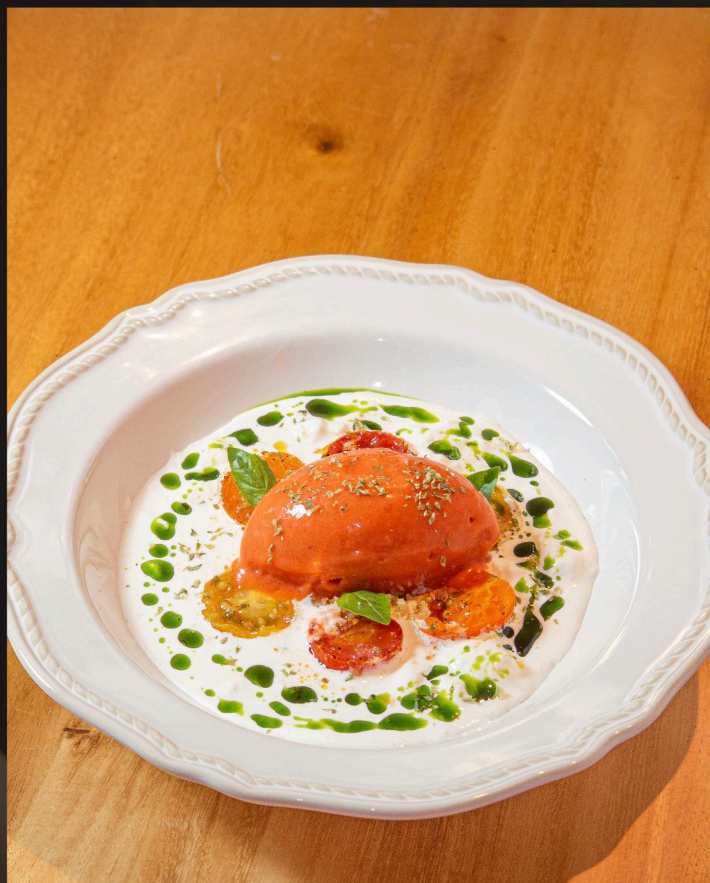
HEART OF BURRATA CHEESE ★ 590 Tomato Candy - Crumble - Tomato Sorbet