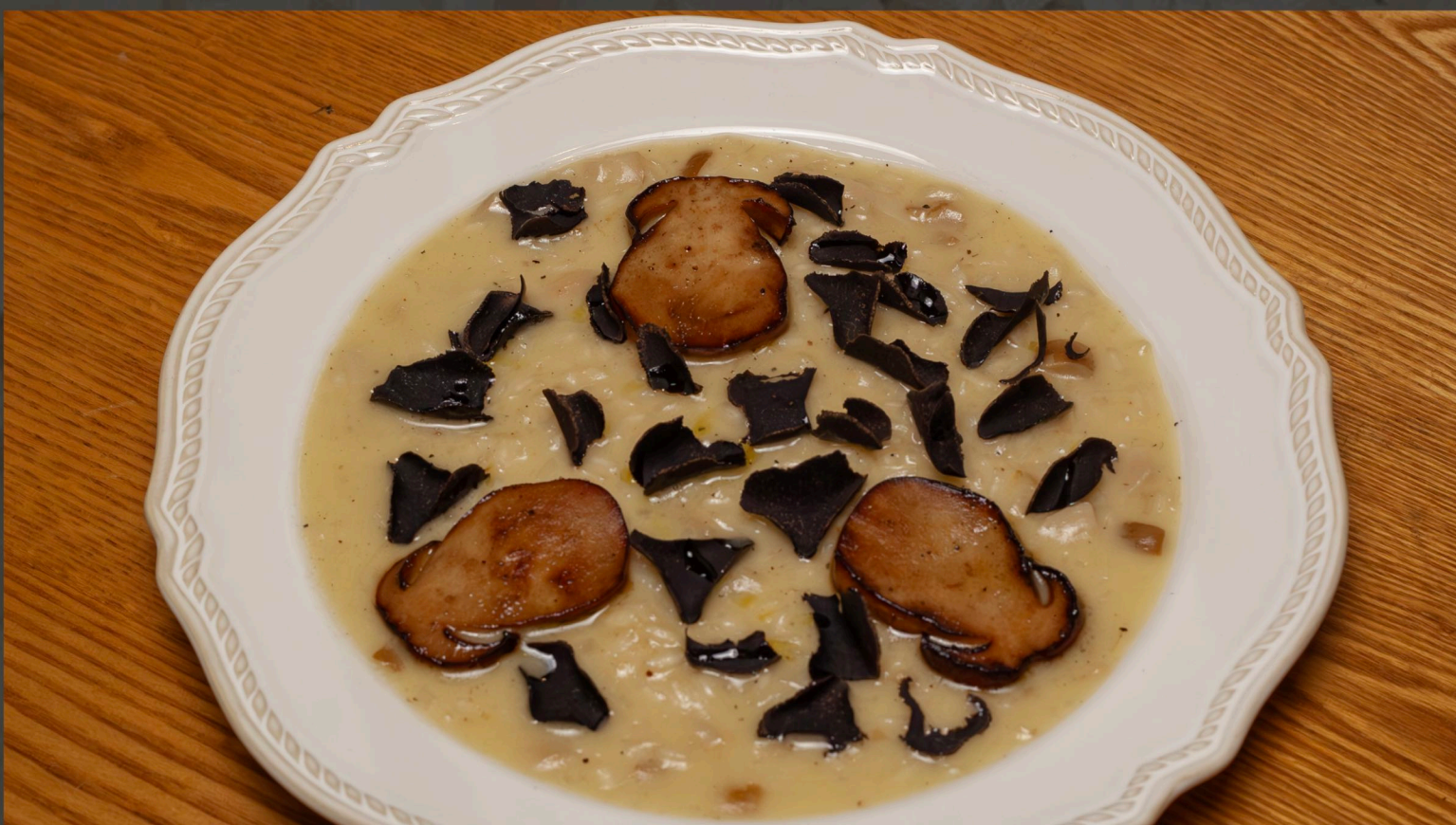
RISOTTO PORCINI Black Truffle