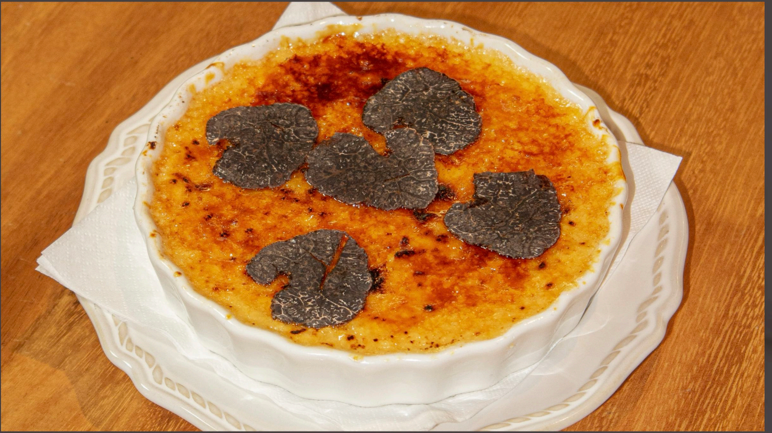
TRUFFLE CRÈME BRÛLÉE