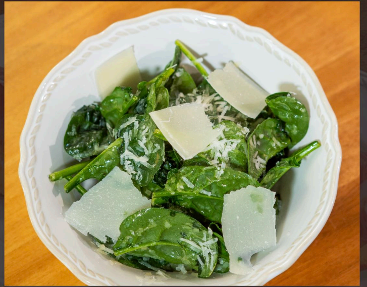
BABY SPINACH LEAVES 220