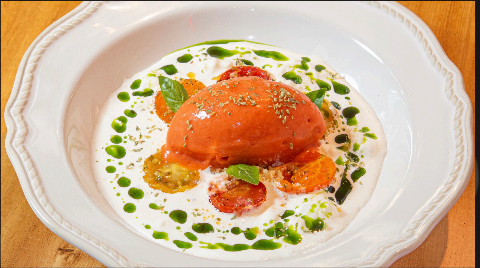
HEART OF BURRATA CHEESE ★ Tomato Candy - Crumble - Tomato Sorbet