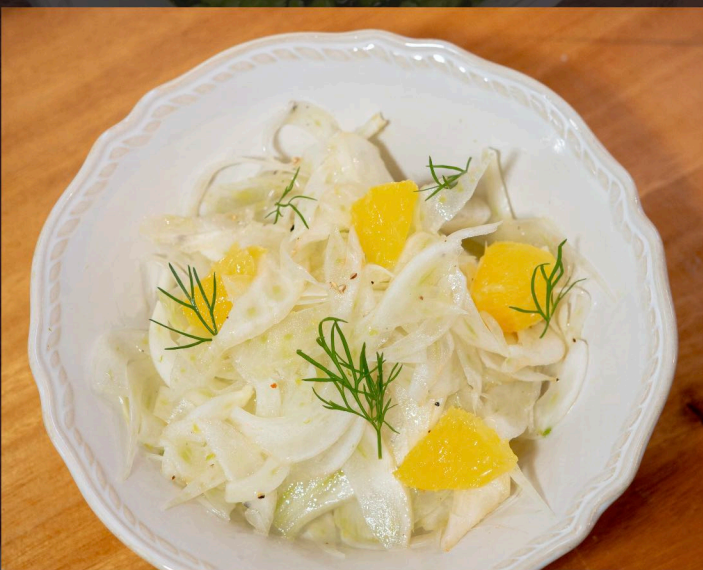
FENNEL SALAD 220