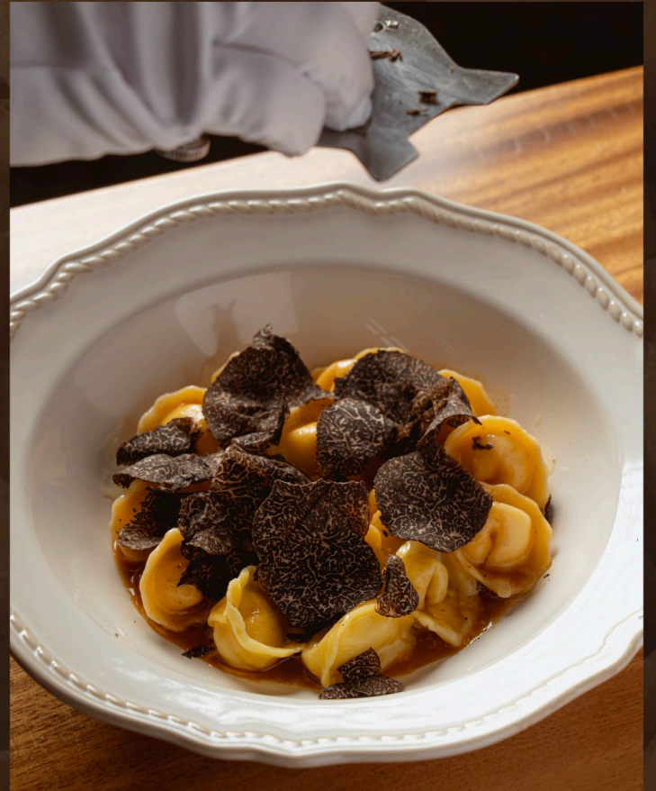
TORTELLINI ★ 690 Parmesan - Italian Black Truffle