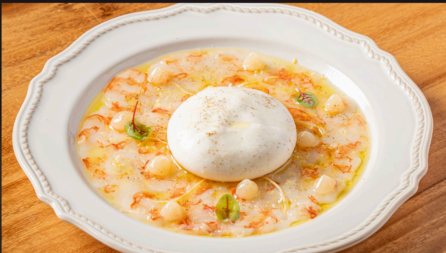
RED PRAWN CARPACCIO ★ Burrata - Lemon