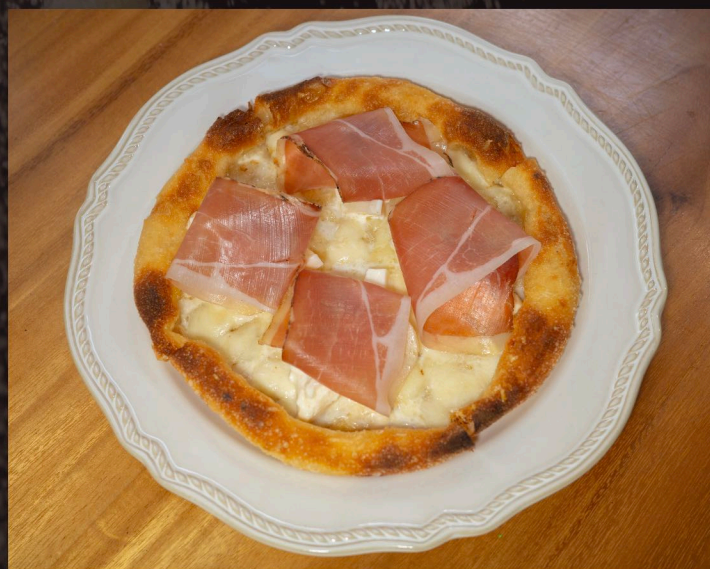
SMOKED BURRATA 350 Reduce Cream - Fior Di Latte - Speck Ham