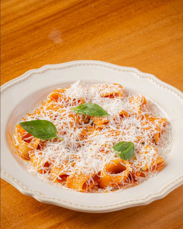
CALAMARATA PASTA 390 Grandma Tomato Sauce - Salted Ricotta Cheese - Basil