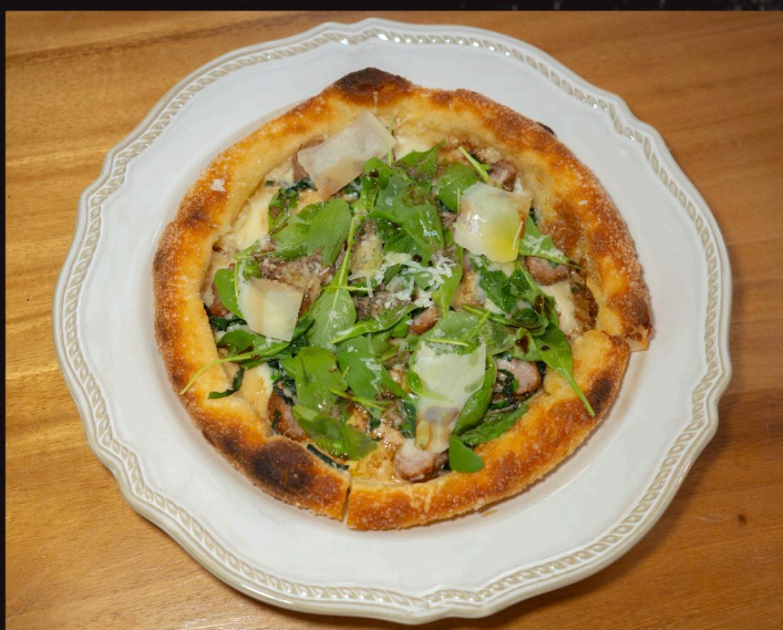
ITALIAN SAUSAGE 250 Fior Di Latte - Parmesan - Wild Rocket - Aged Balsamic