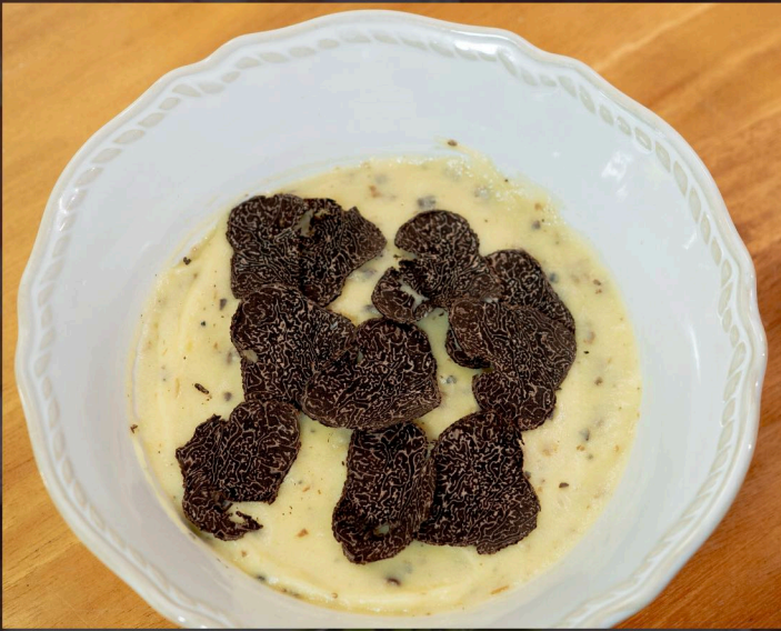
TRUFFLE MASHED POTATO 220