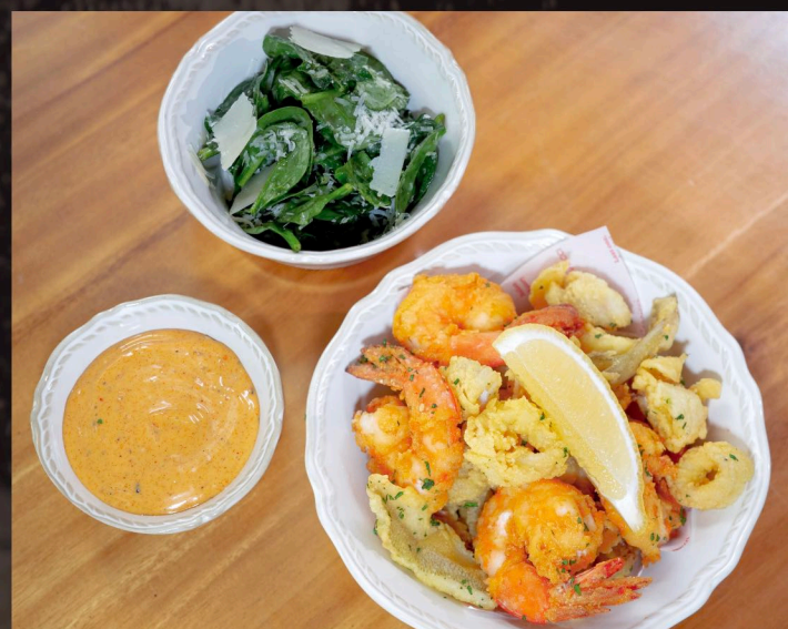
FRITTO MISTO 440 MIXED SEAFOOD Smoked Aioli - Baby Spinach Salad