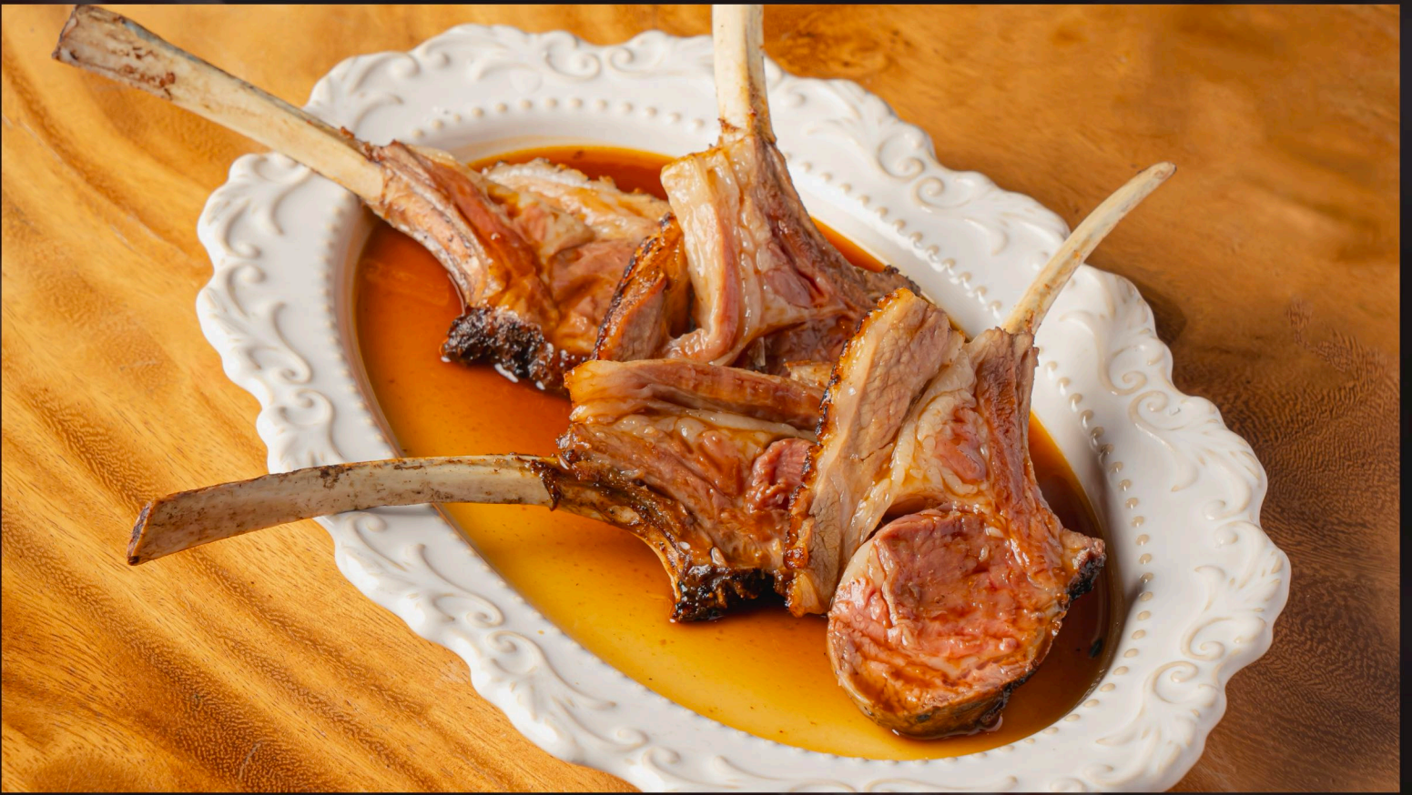
AUSTRALIAN LAMB RACK