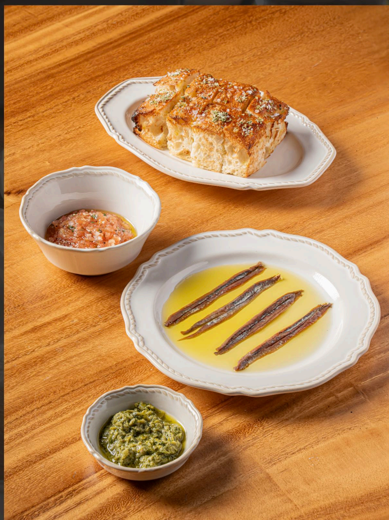
CANTABRIAN ANCHOVY Tomato Chutney - Chili - Focaccia