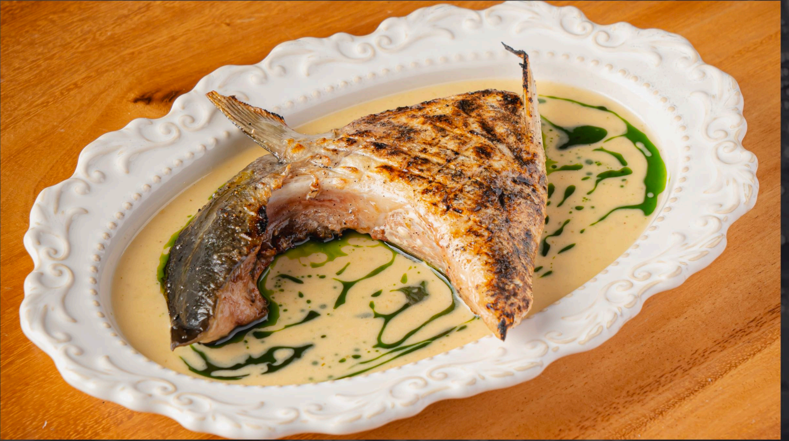
GRILLED YELLOW TAIL COLLAR Mugnaia Sauce