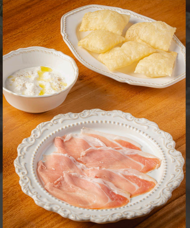
STRACCIATELLA San Daniele - Gnocco Fritto