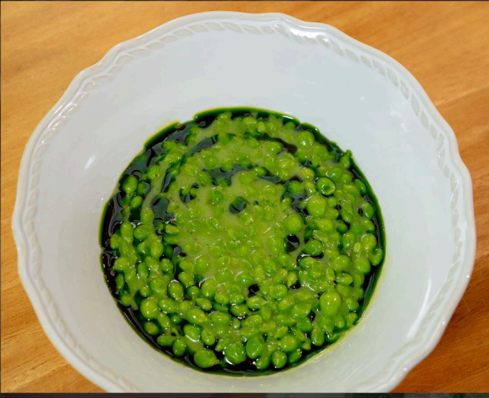
FRESH GREEN PEA WITH OREGANO 220