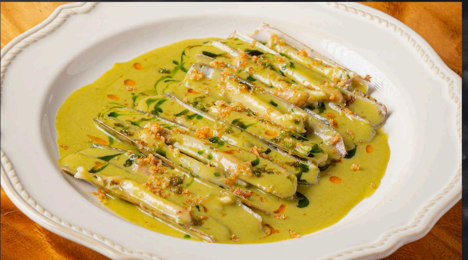
RAZOR CLAM Salsa Scapece