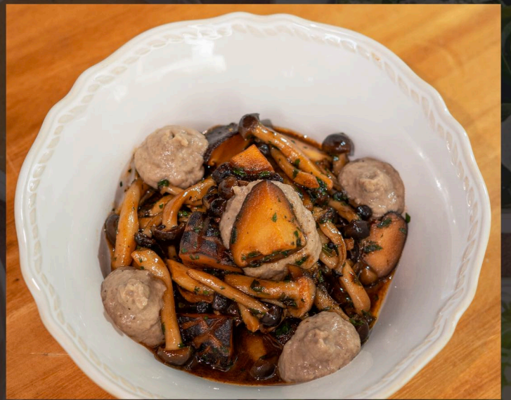
ROASTED MUSHROOM 190