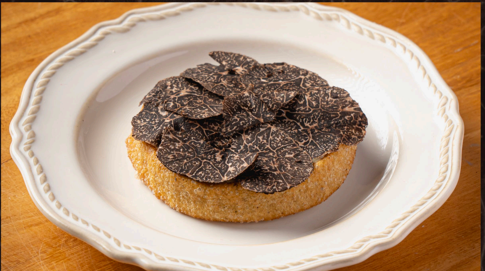
BLACK TRUFFLE Juniper - Porcini Mushroom