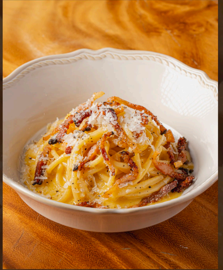
SPAGHETTI CARBONARA 480 Pecorino - Guanciale