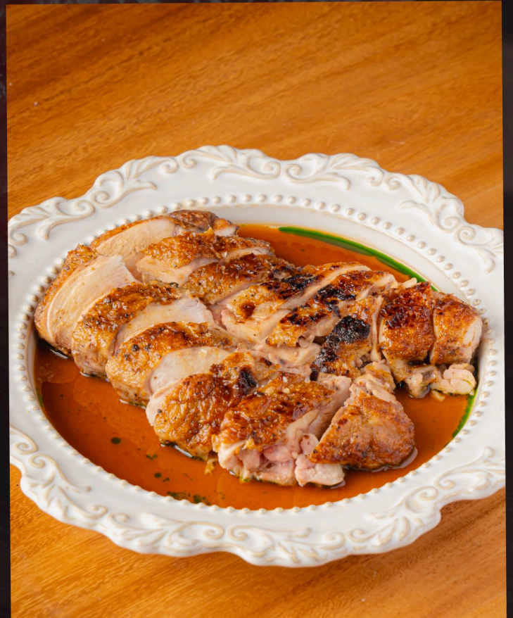
FULL BABY CHICKEN 690 Rosemary Sauce