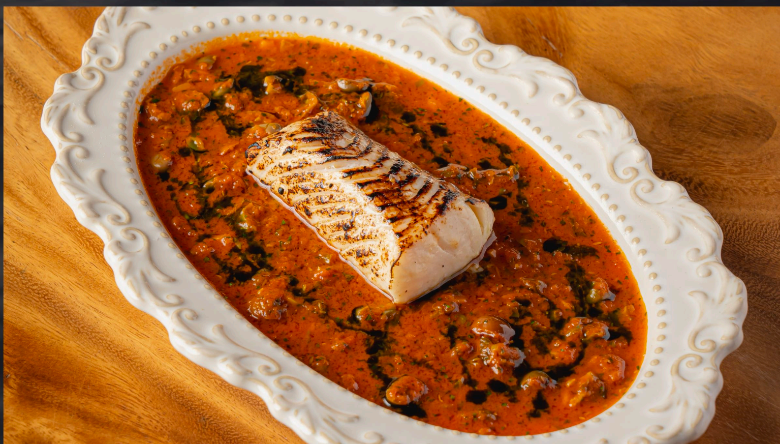
GINDARA BLACK COD Puttanesca Sauce