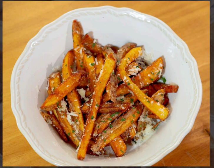
ROASTED POTATO WITH PARMESAN 190