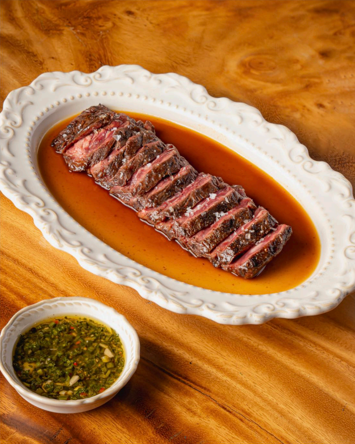
GRILLED HANGER ★ STEAK (250g) 1300 Chimichurri - Beef Jus