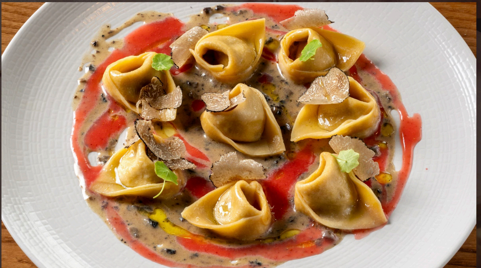
FOIE GRAS RAVIOLI Ricotta - Truffle Cream - Strawberry Juice