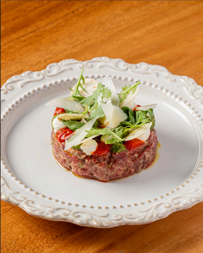
BEEF TARTARE Rocket - Pesto - Parmesan