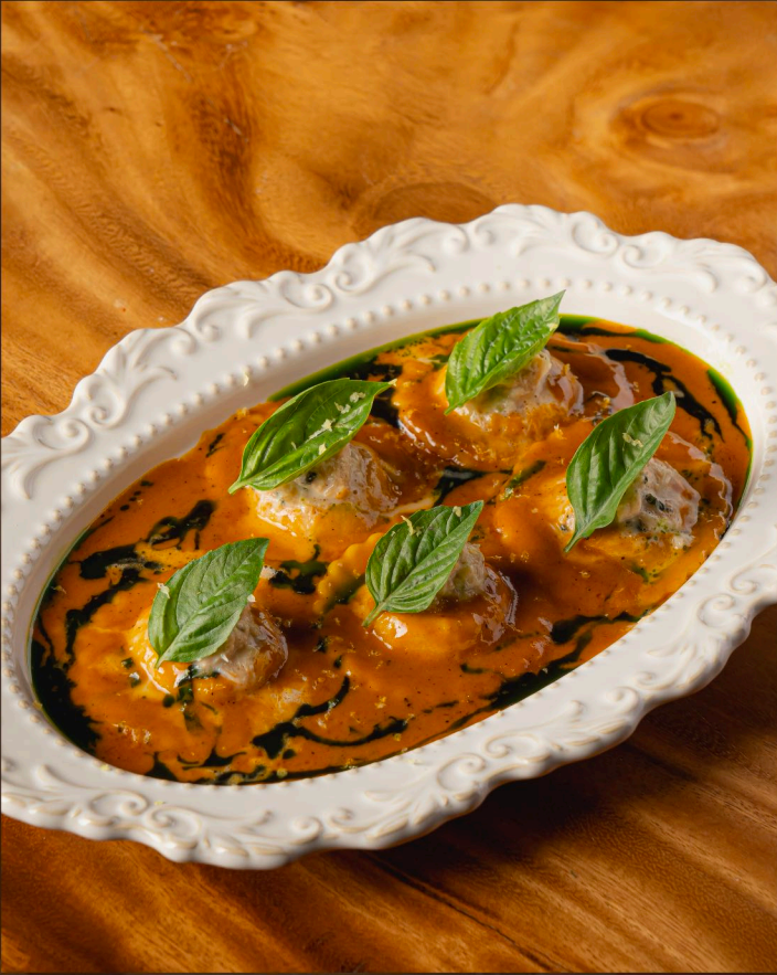
CRAB RAVIOLI 680 Basil - Lime - Chili