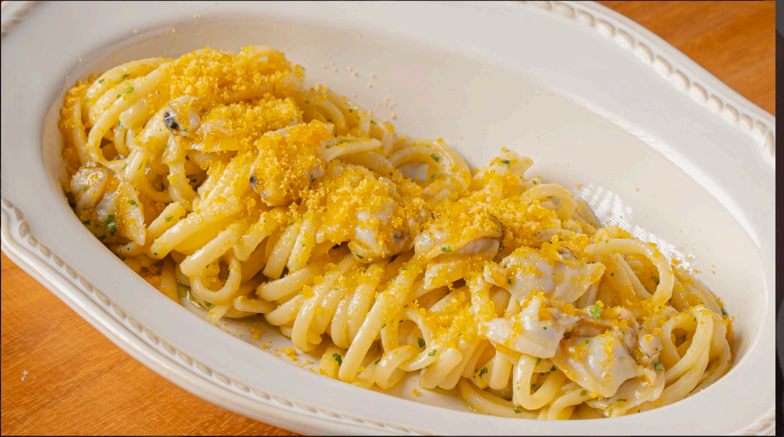
Vongole ★ White Wine Clam Sauce - Chili Oil - Bottarga