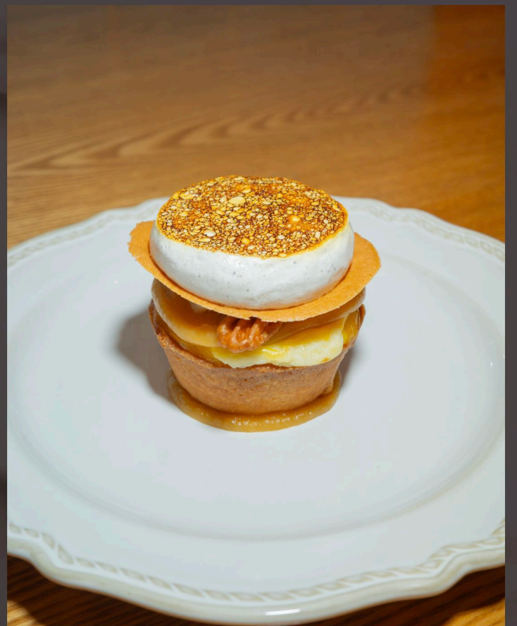
CHEESE TART 390 Apple Jam - Pecan Nuts - Cinnamon Meringue