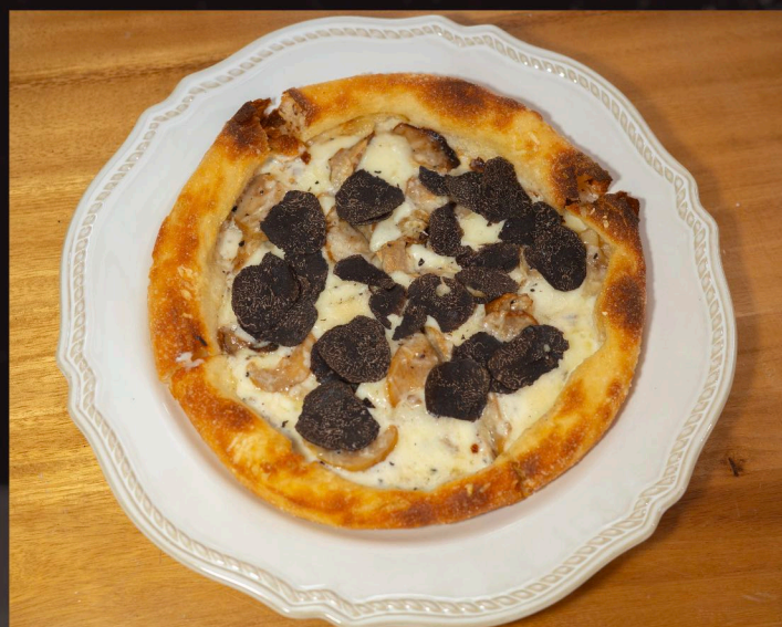
PORCINI MUSHROOMS 480 Fior Di Latte - Mascarpone - Black Truffle