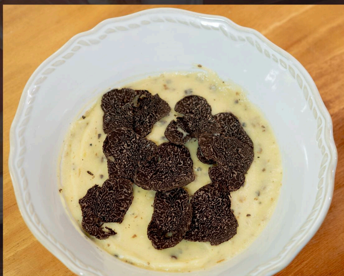
TRUFFLE MASHED POTATO