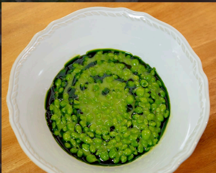
FRESH GREEN PEA WITH OREGANO