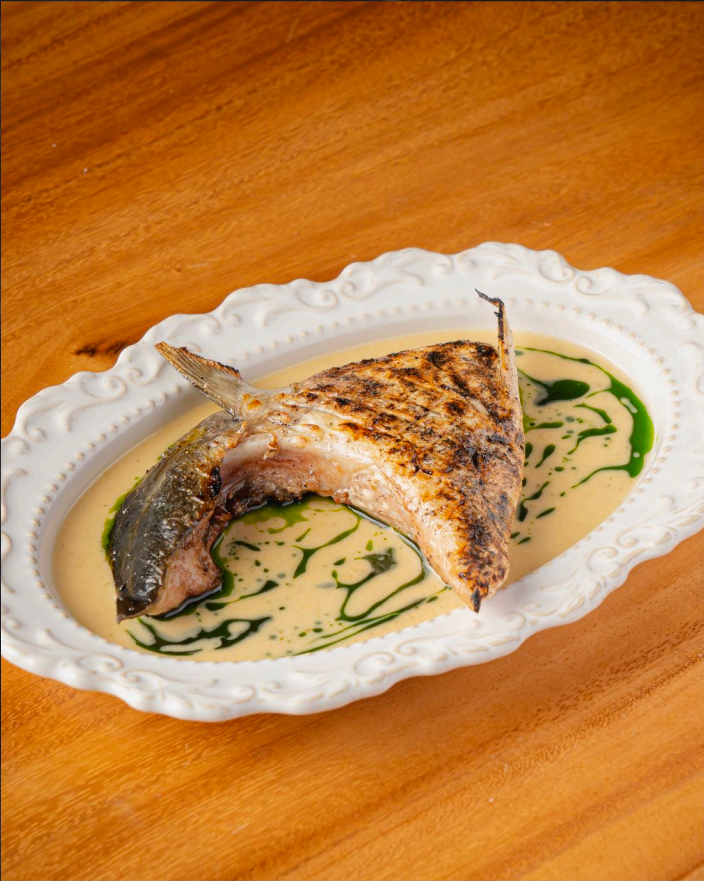
GRILL YELLOW TAIL COLLAR 710 Mugnaia Sauce

Prices are listed in THB and subject to 10% service charge and 7% VAT. Should you have any concerns about food allergies, please inform our staff.