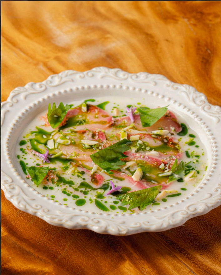
AMBERJACK CARPACCIO Almond Milk - Finger Lime - Shiso