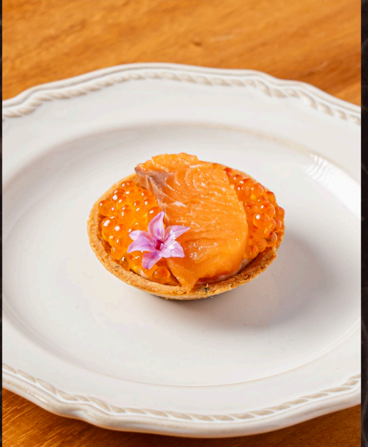
SMOKE IKURA 220/pcs Trout - Dill Tart

Prices are listed in THB and subject to 10% service charge and 7% VAT. Should you have any concerns about food allergies, please inform our staff.