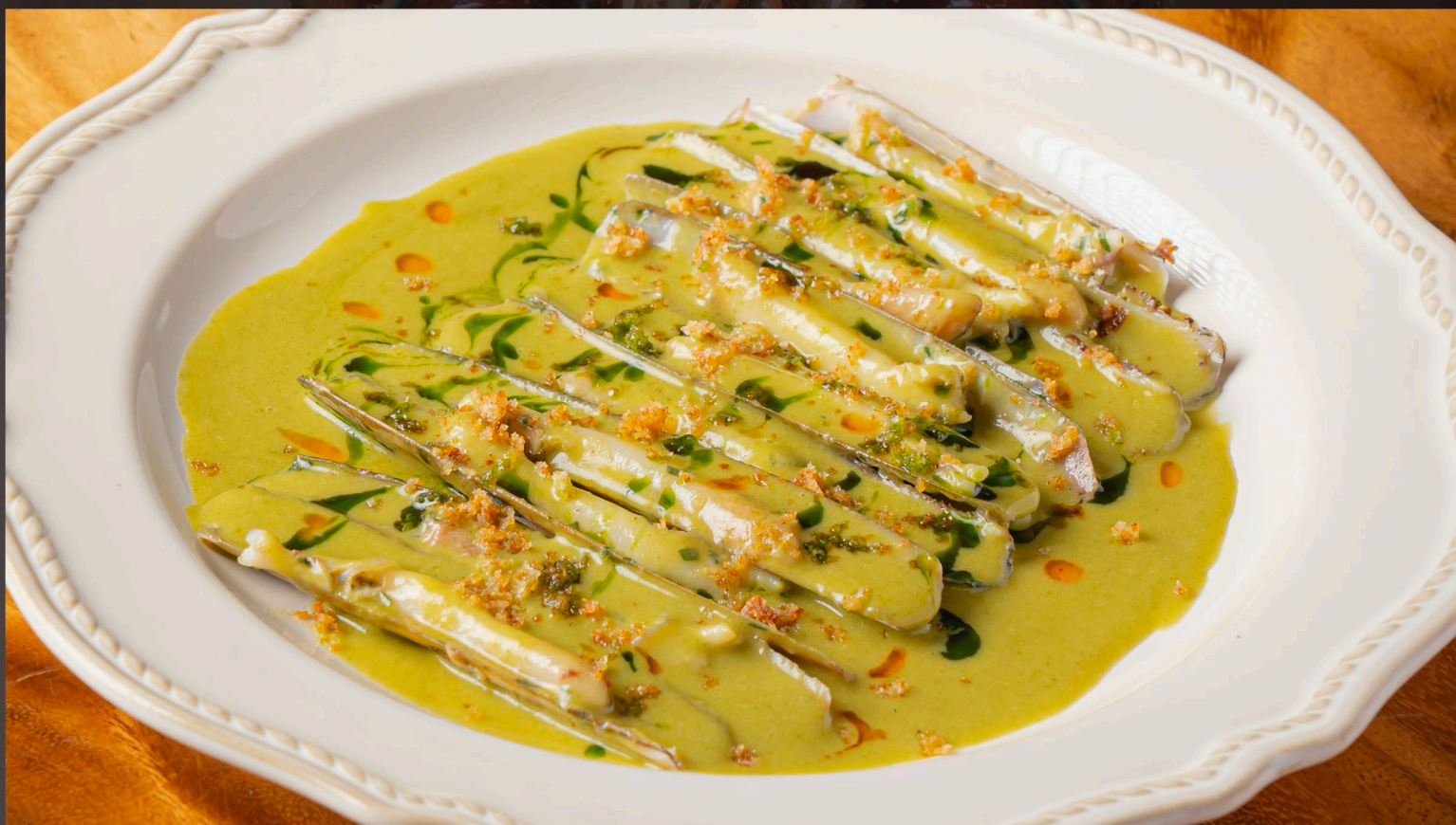
RAZOR CLAM Salsa Scapece