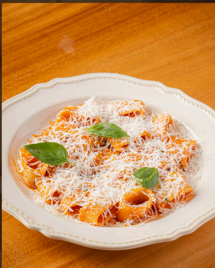
CALAMARATA PASTA Grandma Tomato Sauce - Salted Ricotta Cheese - Basil