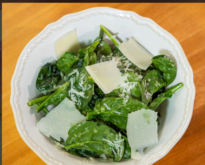
BABY SPINACH LEAVES