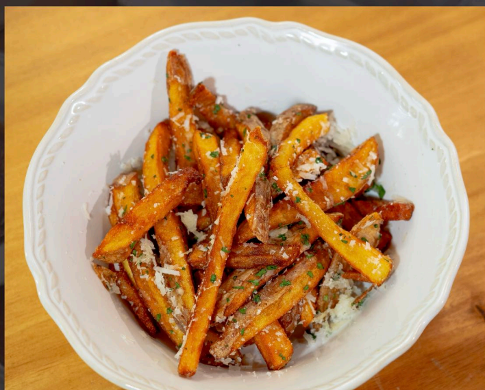
ROAST POTATO WITH PARMESAN