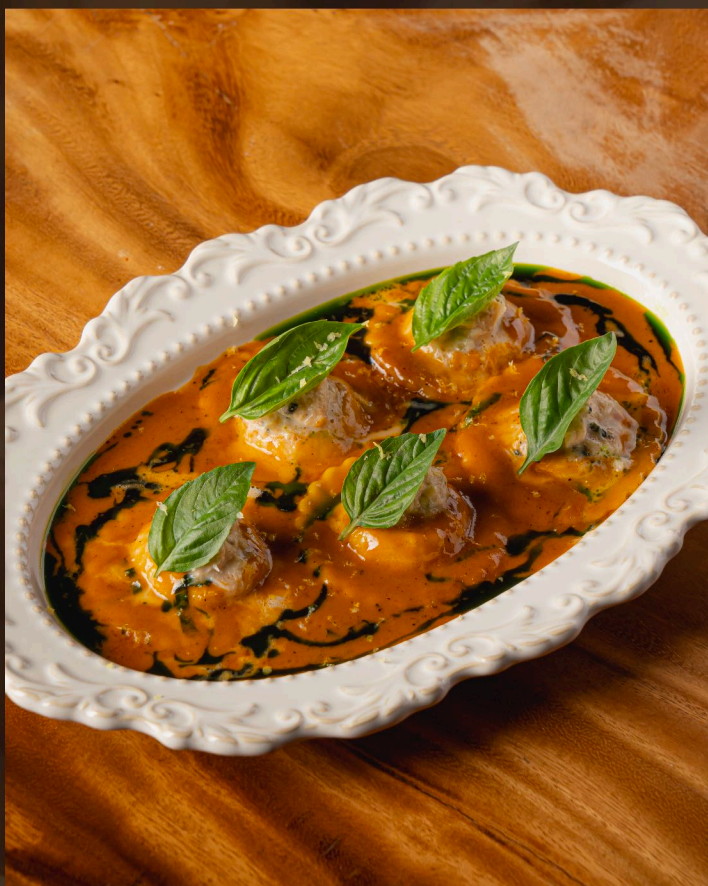
CRAB RAVIOLI Basil - Lime - Chili