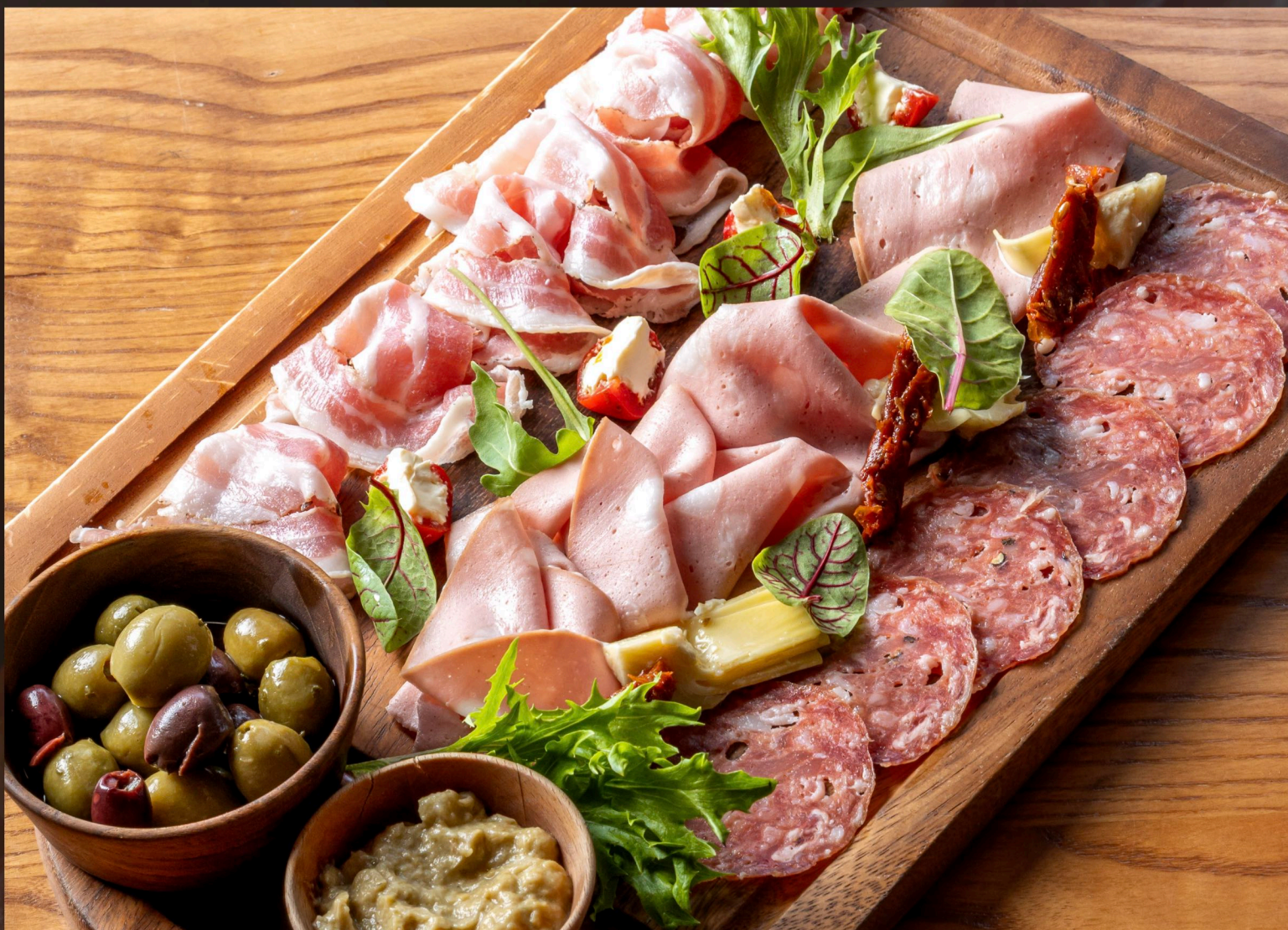
SELECTION OF ITALIAN ARTISANAL COLD CUTS