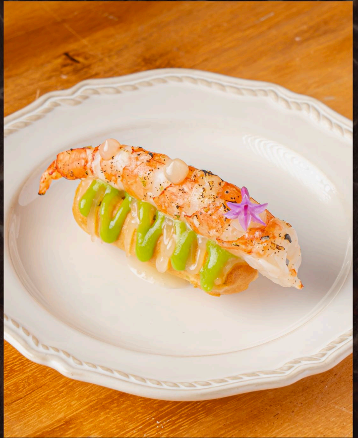
RED PRAWN ★ 220/pcs Basil Bignè - Lemon - Chili