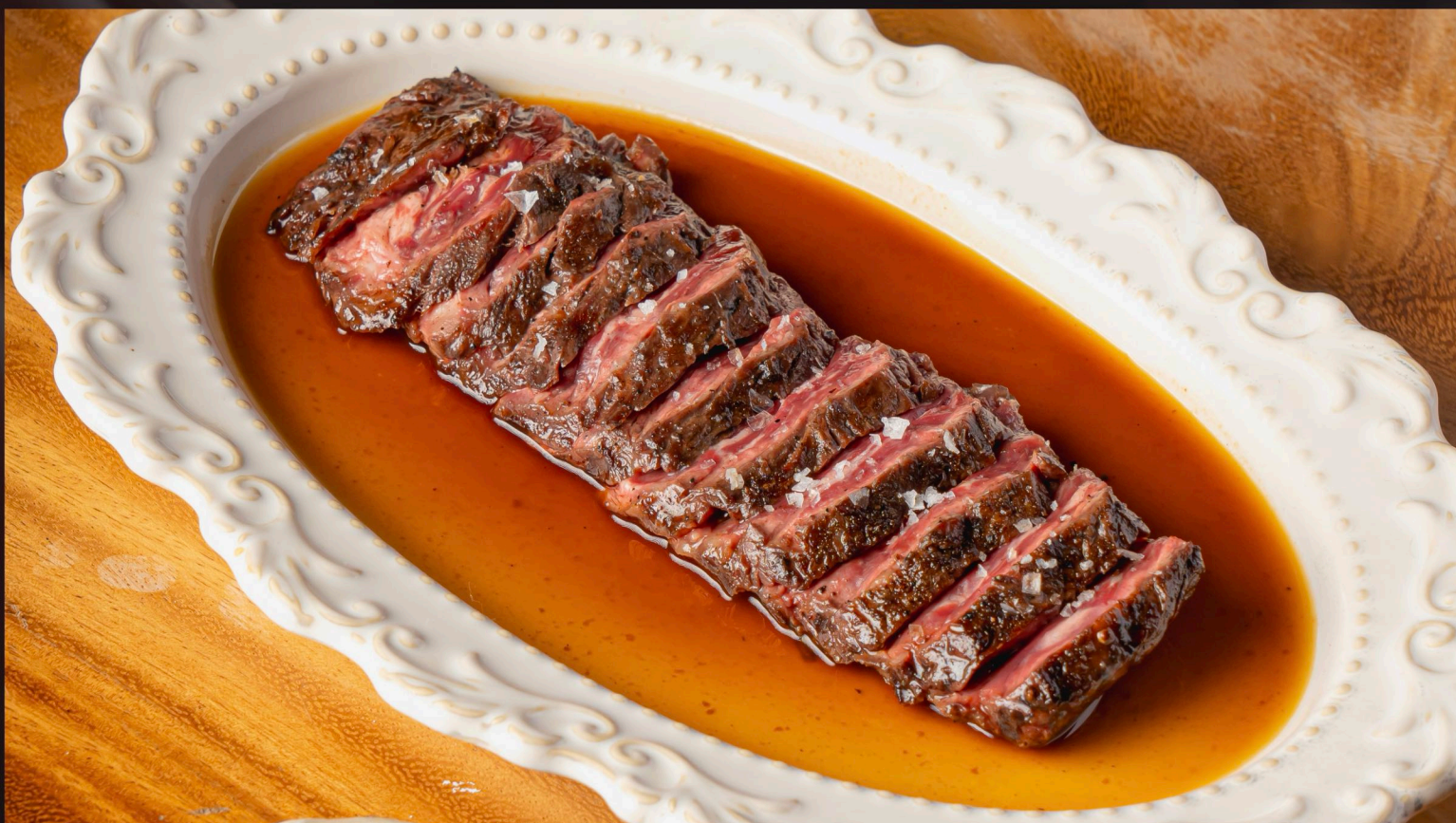
GRILLED HANGER STEAK (250g) ★ Chimichurri - Beef Jus