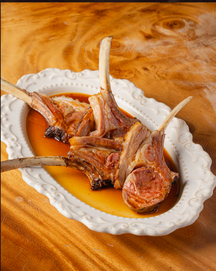
AUSTRALIAN LAMB RACK 2 Rib / 1040 4 Rib / 1880