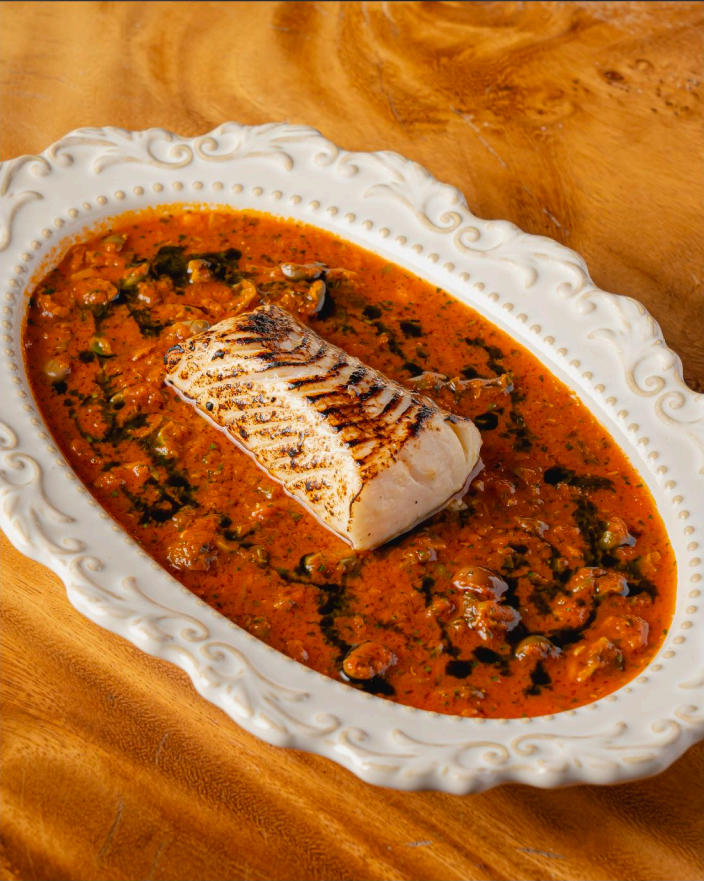
GINDARA BLACK COD 890 Puttanesca Sauce