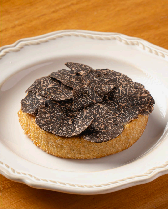
BLACK TRUFFLE 390/pcs Juniper - Porcini Mushroom