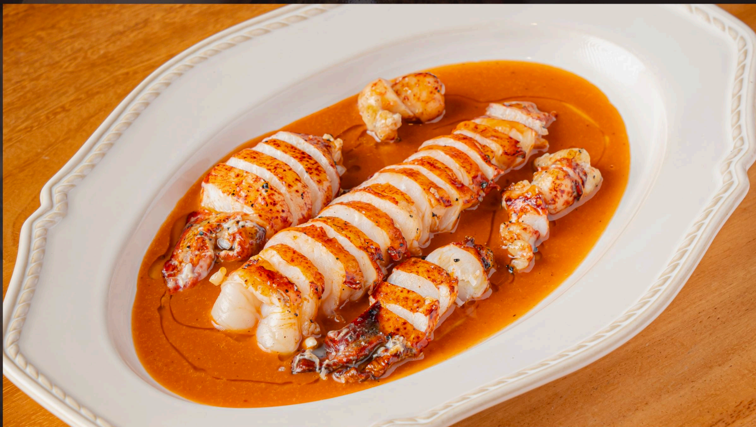
GRILL LOBSTER Bisque