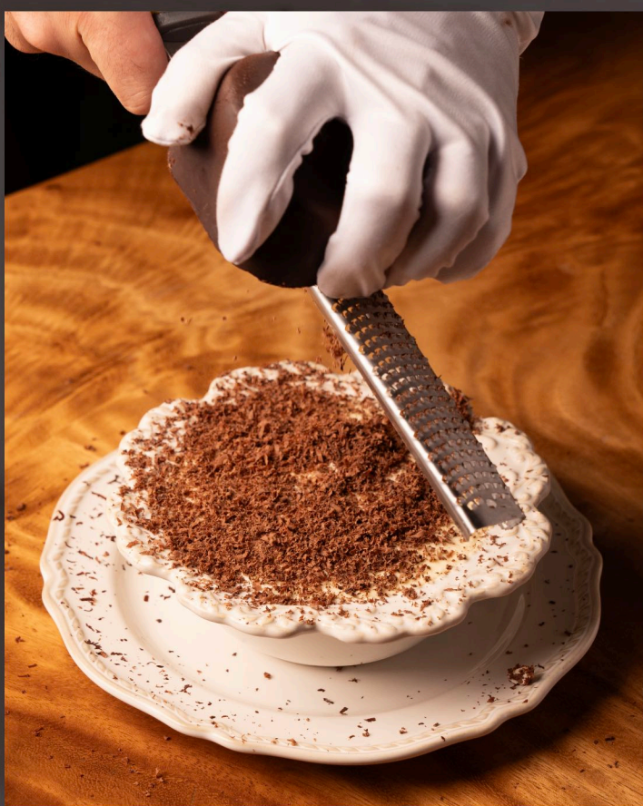
CAPRICCI TIRAMISU ★ 290