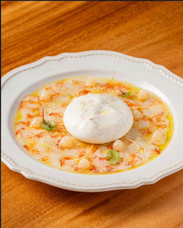
RED PRAWN ★ CARPACCIO Burrata - Lemon