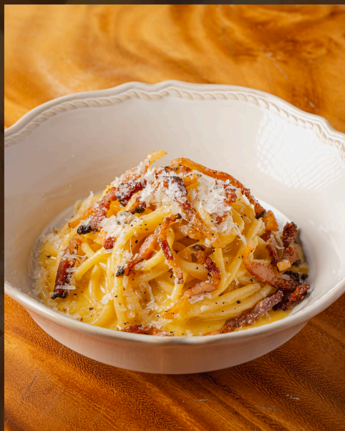
SPAGHETTI CARBONARA Pecorino - Guanciale