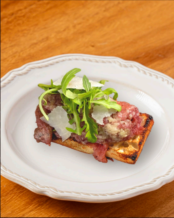
WAGYU BEEF 180/pcs CARPACCIO Crispy Bread - Wild Rocket - Parmesan