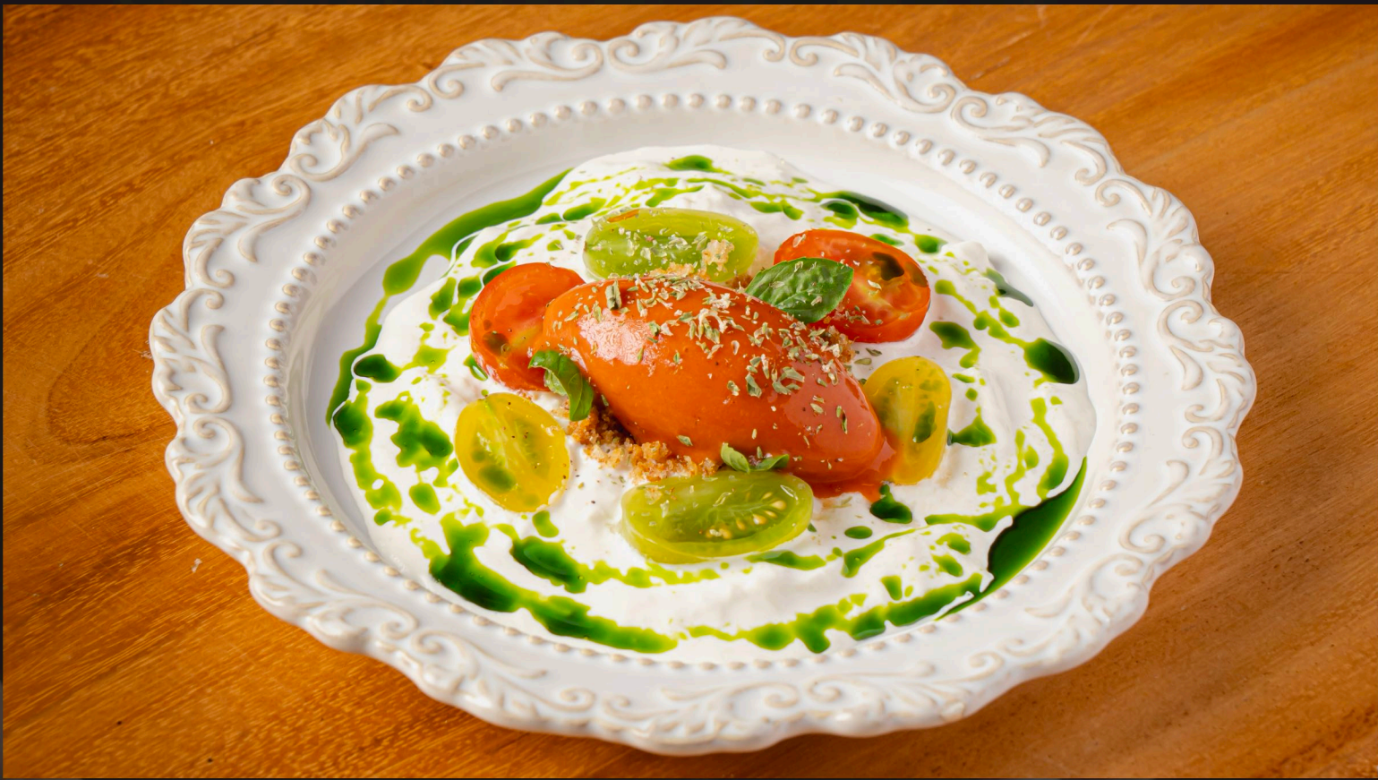
HEART OF BURRATA CHEESE ★ 590 Tomato Candy - Crumble - Tomato Sorbet