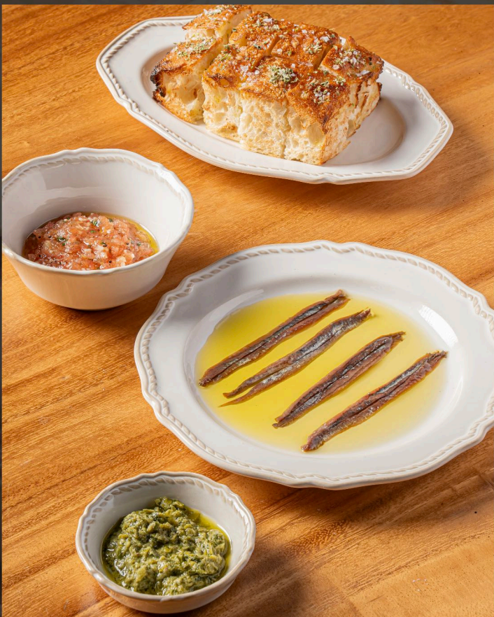
CANTABRIAN ANCHOVY Tomato Chutney - Chili - Focaccia