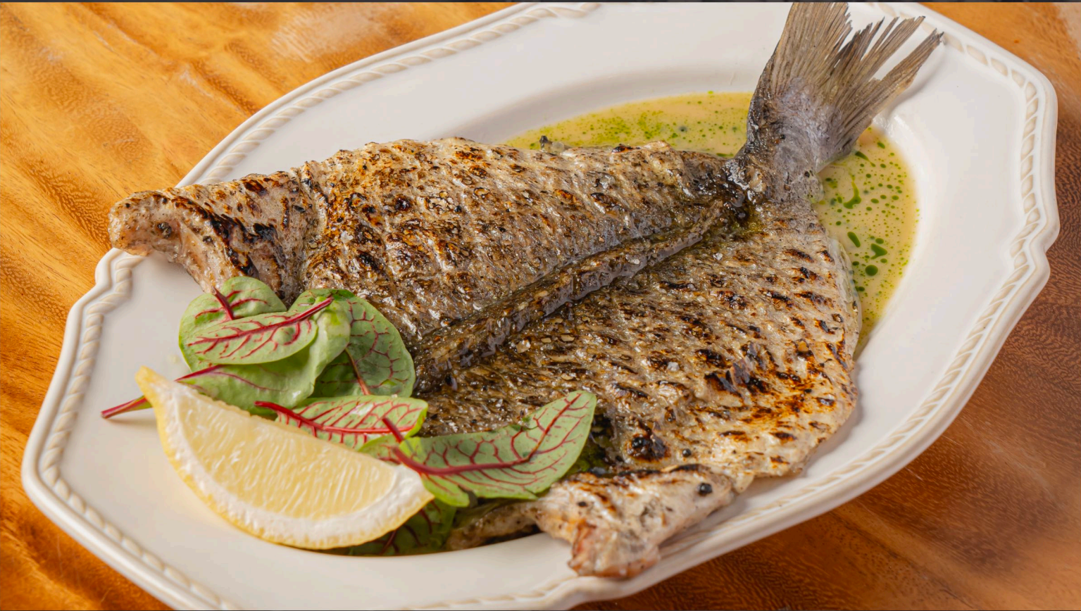
GRILLED SEA BREAM ★ Lemon Sauce 1300