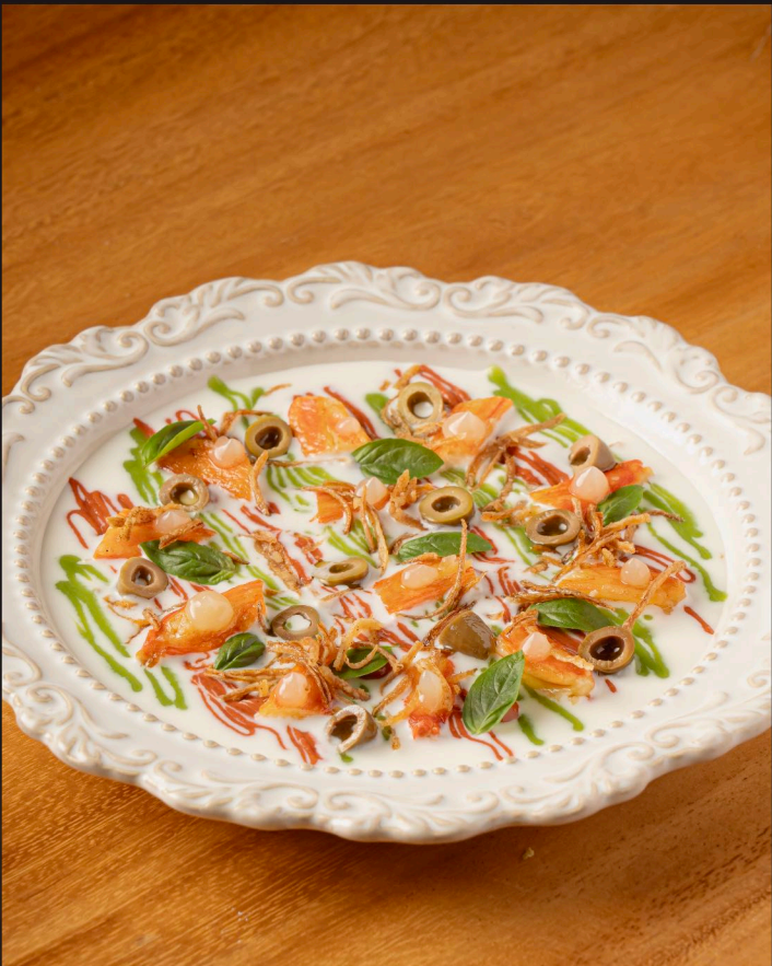
GRILL SNOW GRAB Tomato Panzanella - Buttermilk - Basil