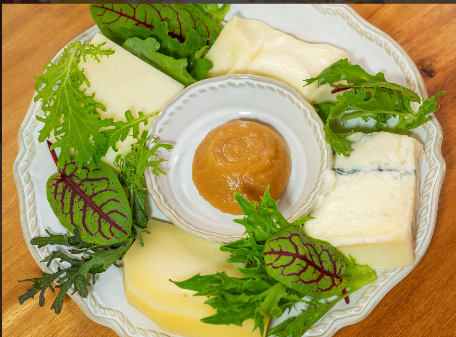
SELECTION OF ITALIAN ARTISANAL CHEESES