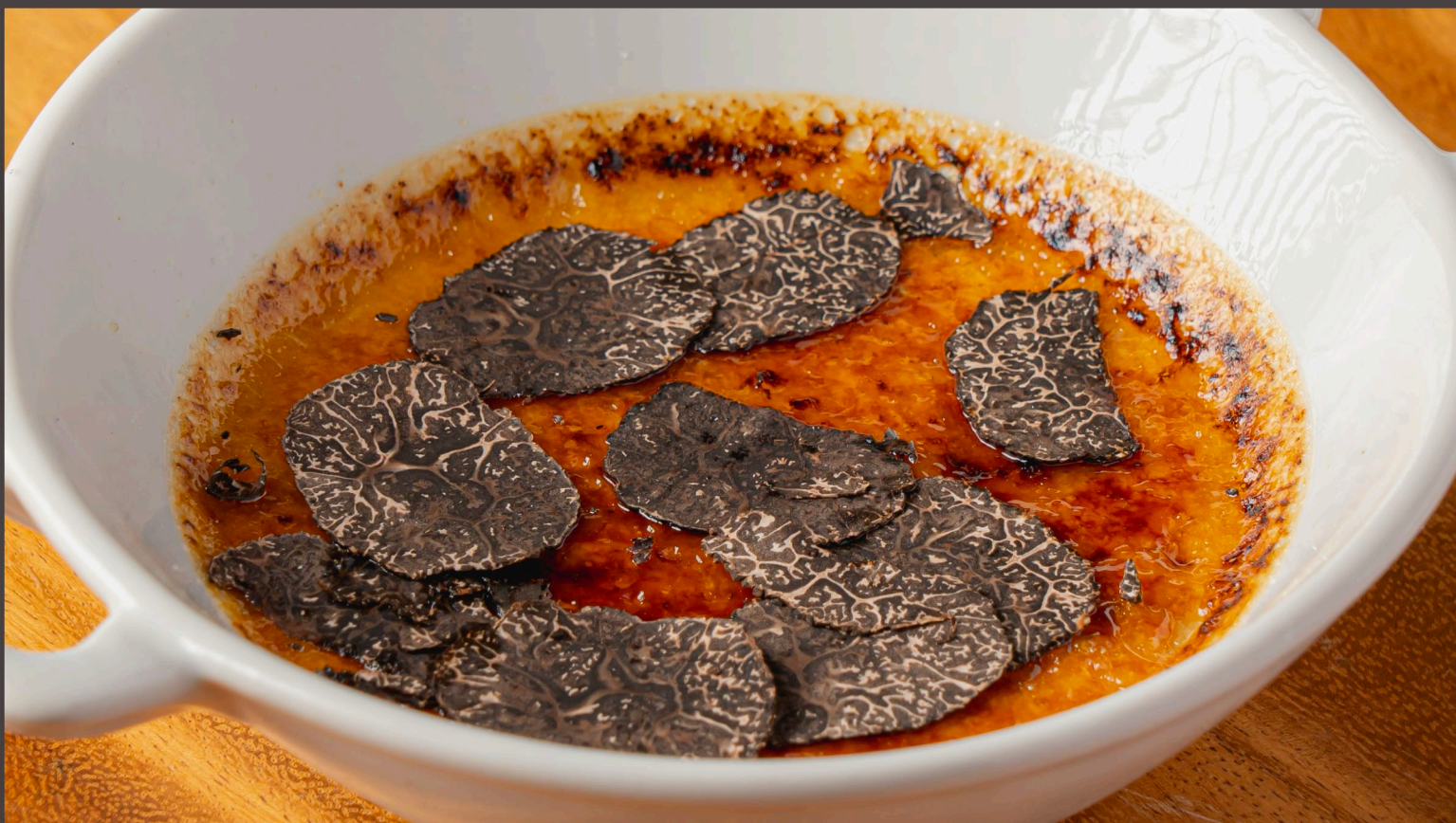
TRUFFLE CRÈME BRÛLÉE