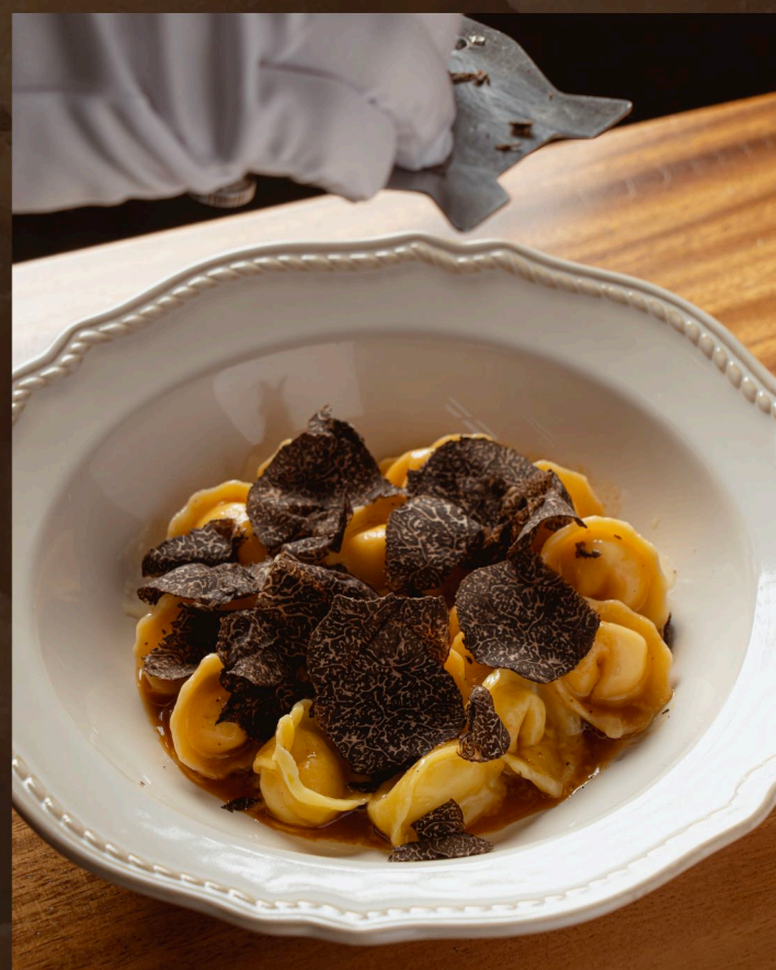
TORTELLINI ★ Parmesan - Italian Black Truffle