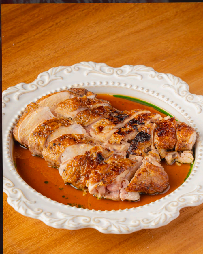
FULL BABY CHICKEN 690 Rosemary Sauce

Prices are listed in THB and subject to 10% service charge and 7% VAT. Should you have any concerns about food allergies, please inform our staff.