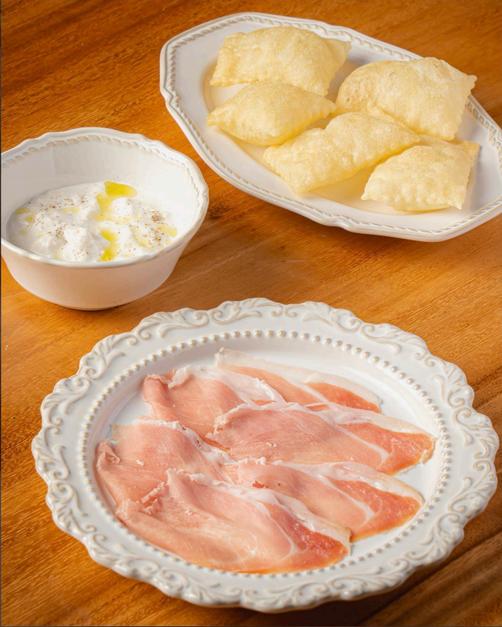
STRACCIATELLA 690 San Daniele - Gnocco Fritto

Prices are listed in THB and subject to 10% service charge and 7% VAT. Should you have any concerns about food allergies, please inform our staff.